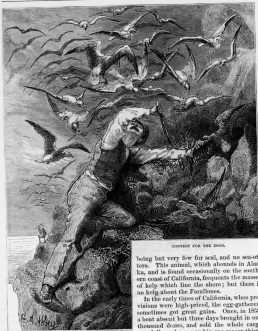
CONTEST FOR THE EGGS.

being but very few fur seal, and no sea-otters. This animal, which abounds in Alaska, and is found occasionally on the southern coast of California, frequents the masses of kelp which line the shore; but there is no kelp about the Farallones.